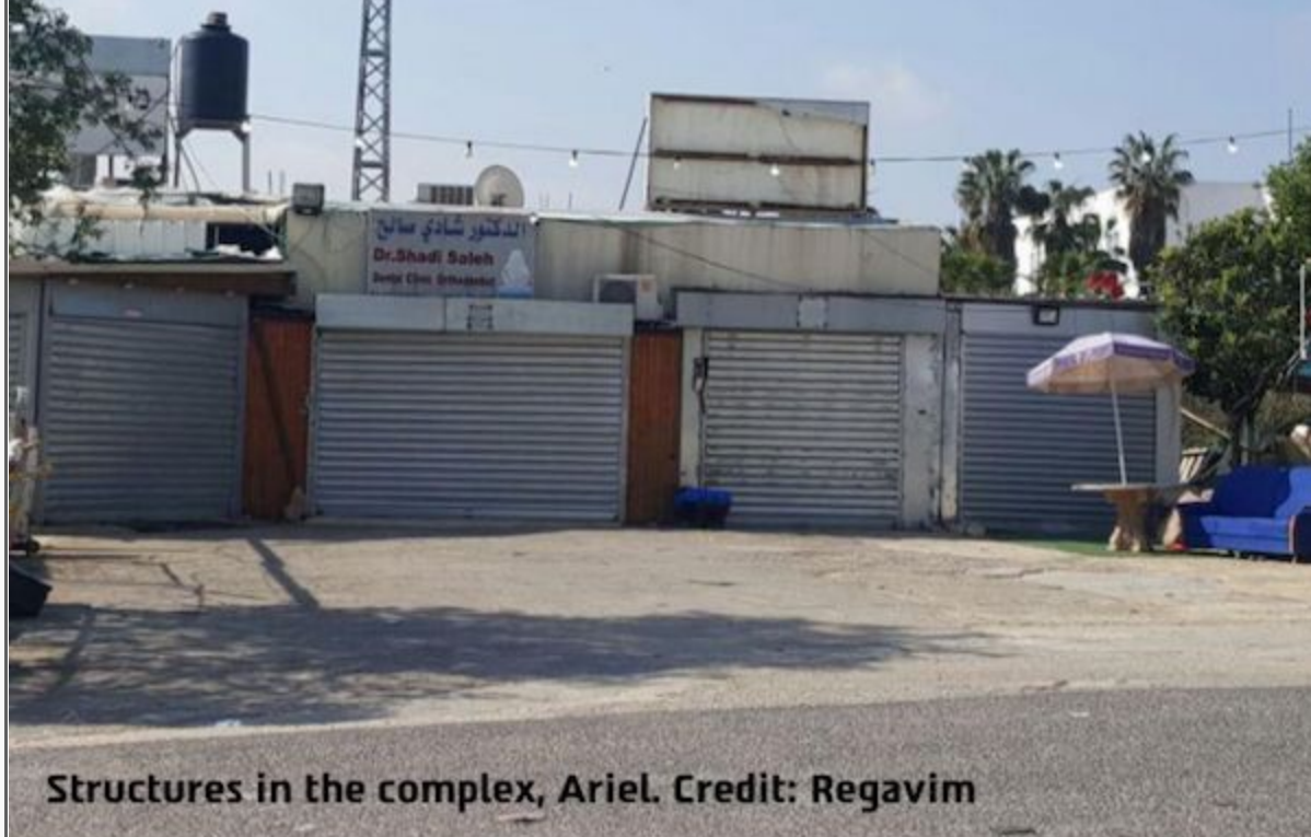
Structures in the complex, Ariel.