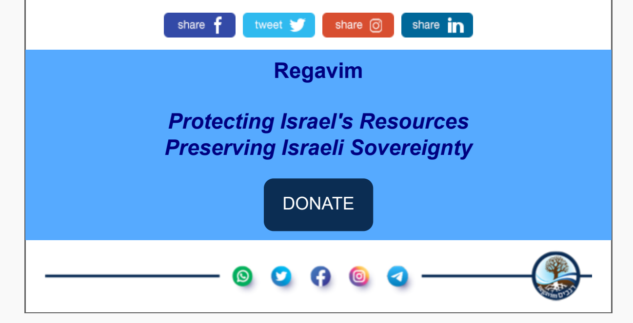
Powered by Publicators